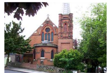
St Joseph's Catholic Church, Shooters Hill

If you cannot attend mass, please visit our website , and click the Donate button, or scan the code with your phone, which will take you to our website (all details below). If you are a taxpayer, please remember to tick the 'Gift Aid' box. God bless Ave Maria